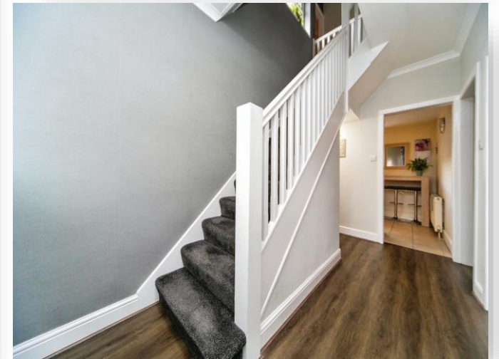
Greenway, Greasby Wirral CH49 2NW