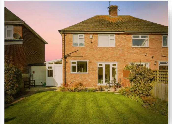
Harvey Avenue, Greasby CH49 1RT