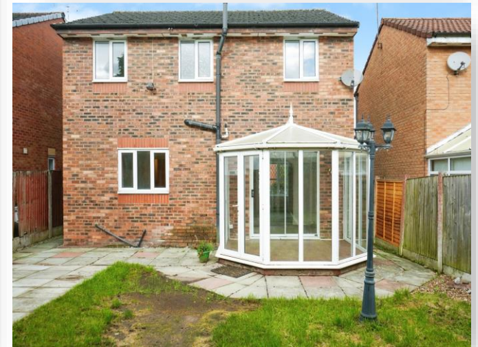
Fletcher Close, Wirral CH49 5PH