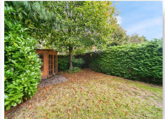
Bleasdale Close, Upton CH49 6QL