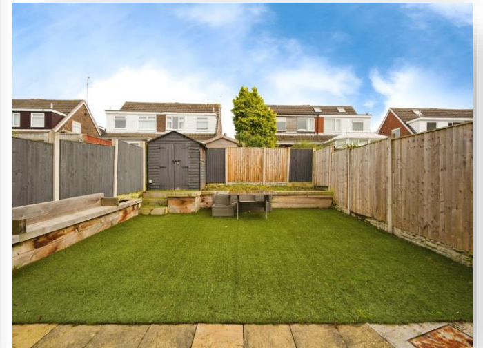
Sycamore Avenue, Saughall Massie CH49 4QJ