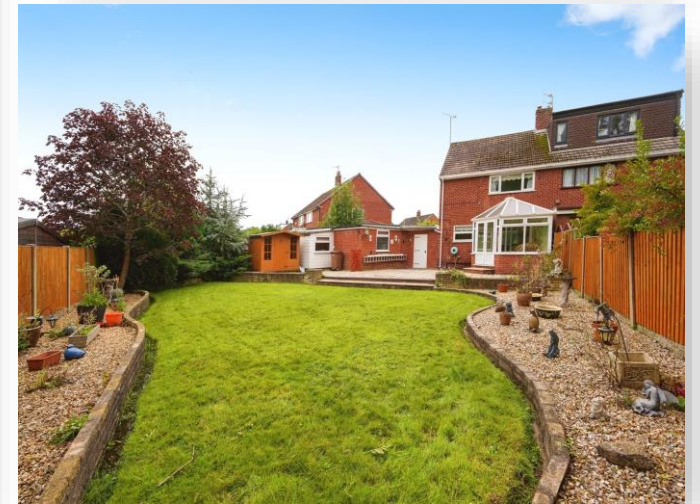
Whitewell Drive, Upton CH49 4PF