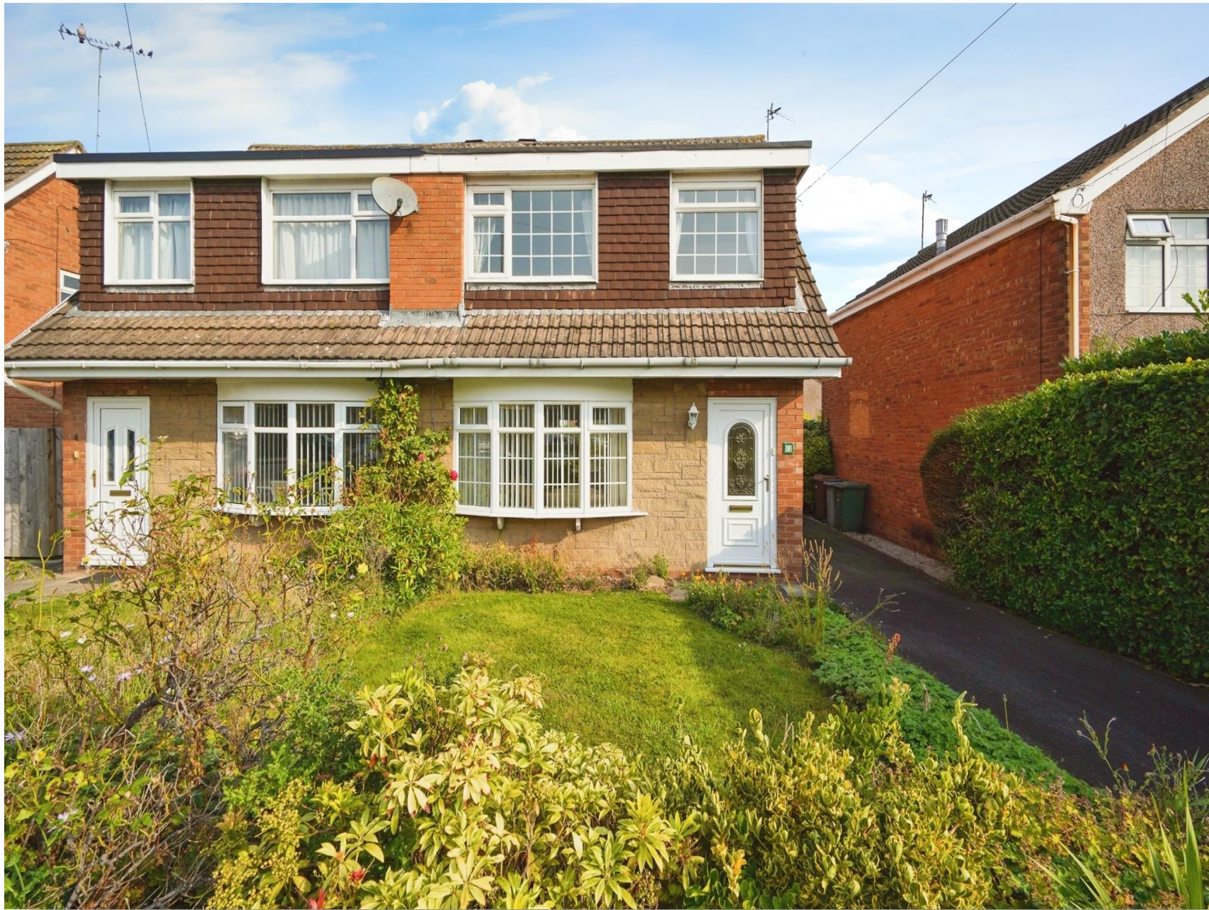
Curlew Avenue, Upton Wirral CH49 4QA