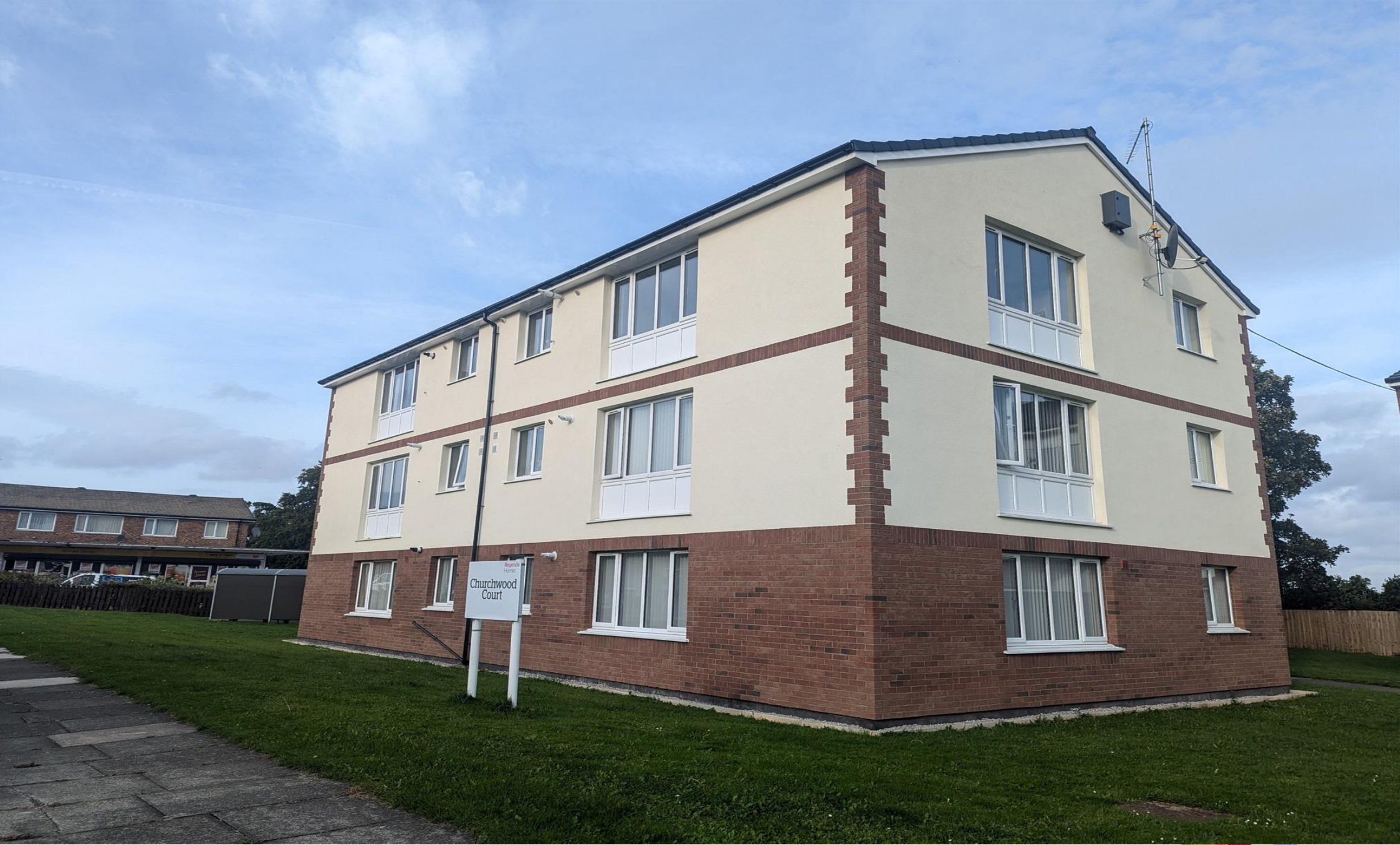
Churchwood Court, Wirral CH49 5NN