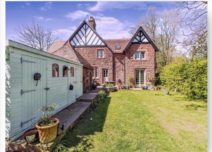
Roodee Cottages Hillbark Road, Frankby CH48 1NR