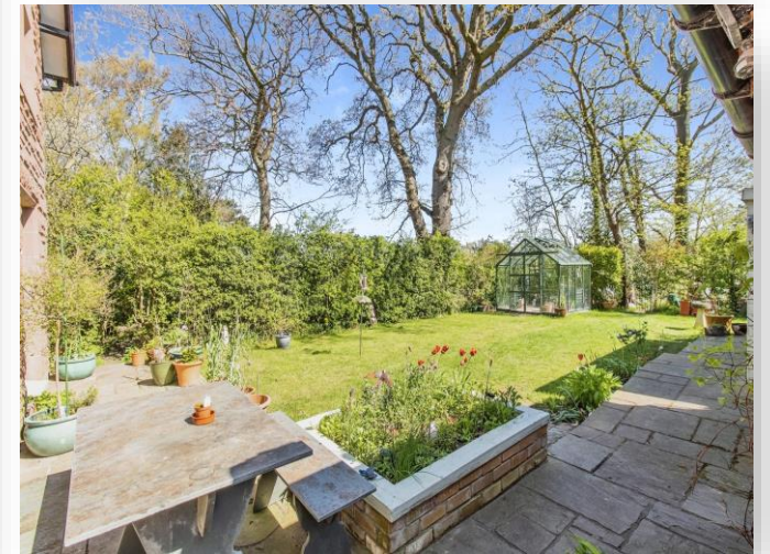
Roodee Cottages Hillbark Road, Frankby CH48 1NR