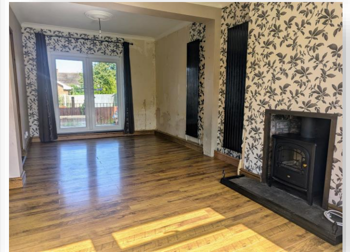
New Hey Road, Wirral CH49 7NH