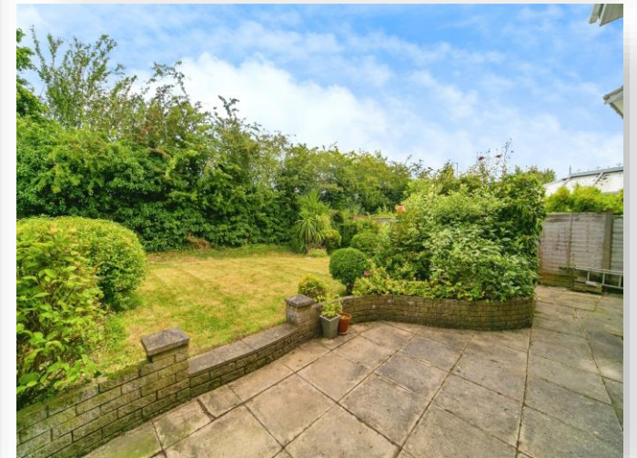
Coleman Drive, Greasby Wirral CH49 3AJ