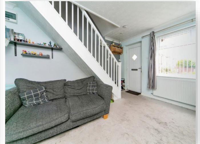
Blakenhall Way, Saughall Massie Wirral CH49 4RD