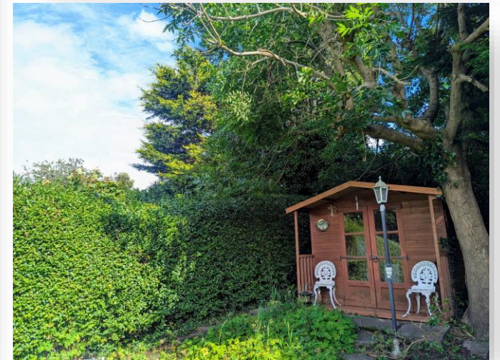
Seaview Lane, Wirral CH61 3UL