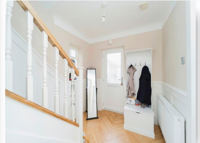
Harvey Avenue, Wirral CH49 1RT