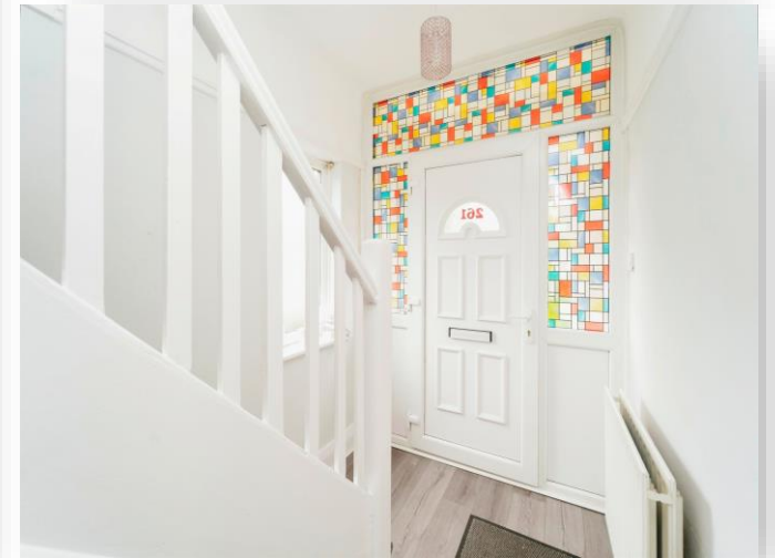
Greasby Road, Greasby Wirral CH49 2PG