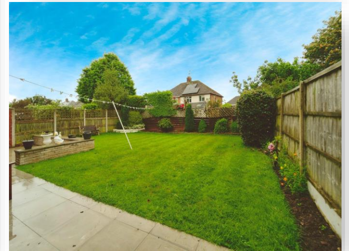
Brookdale Avenue South, Greasby CH49 1SS