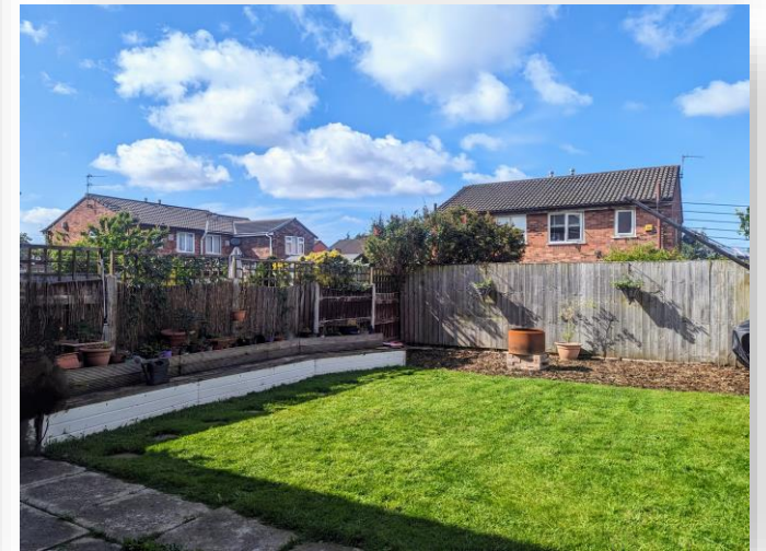
Butterton Avenue, Saughall Massie CH49 4RA