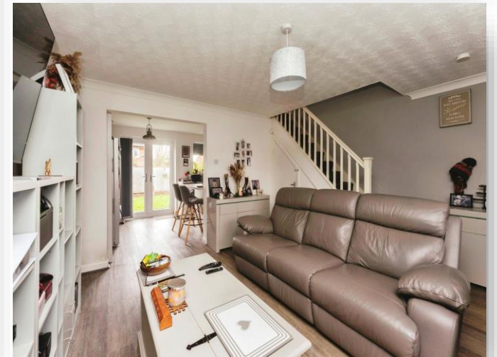
Butterton Avenue, WIRRAL CH49 4RA