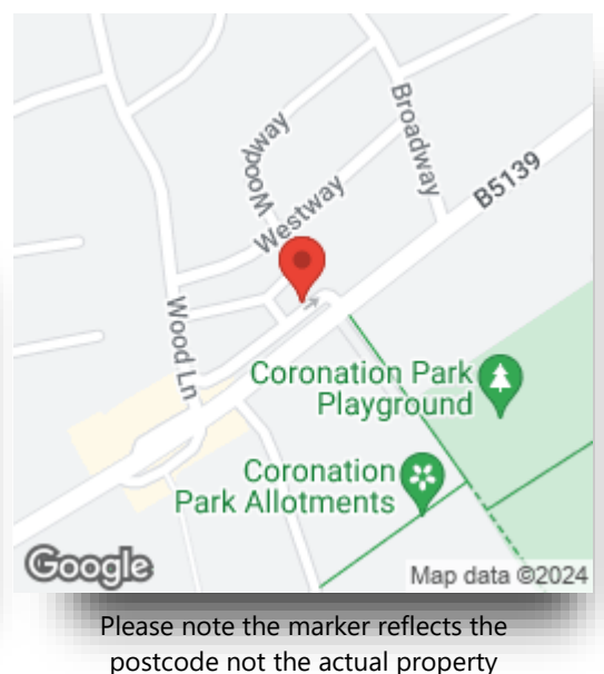
view this property online jonesandchapman.co.uk/Property/GRE105398