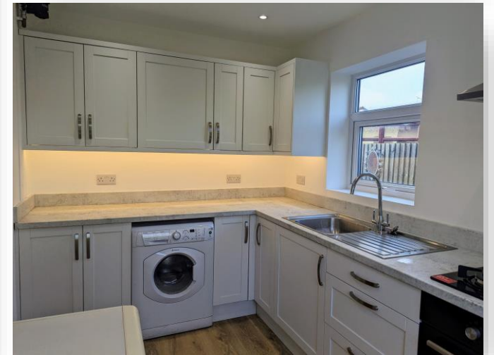
Summertrees Close, Wirral CH49 2SD