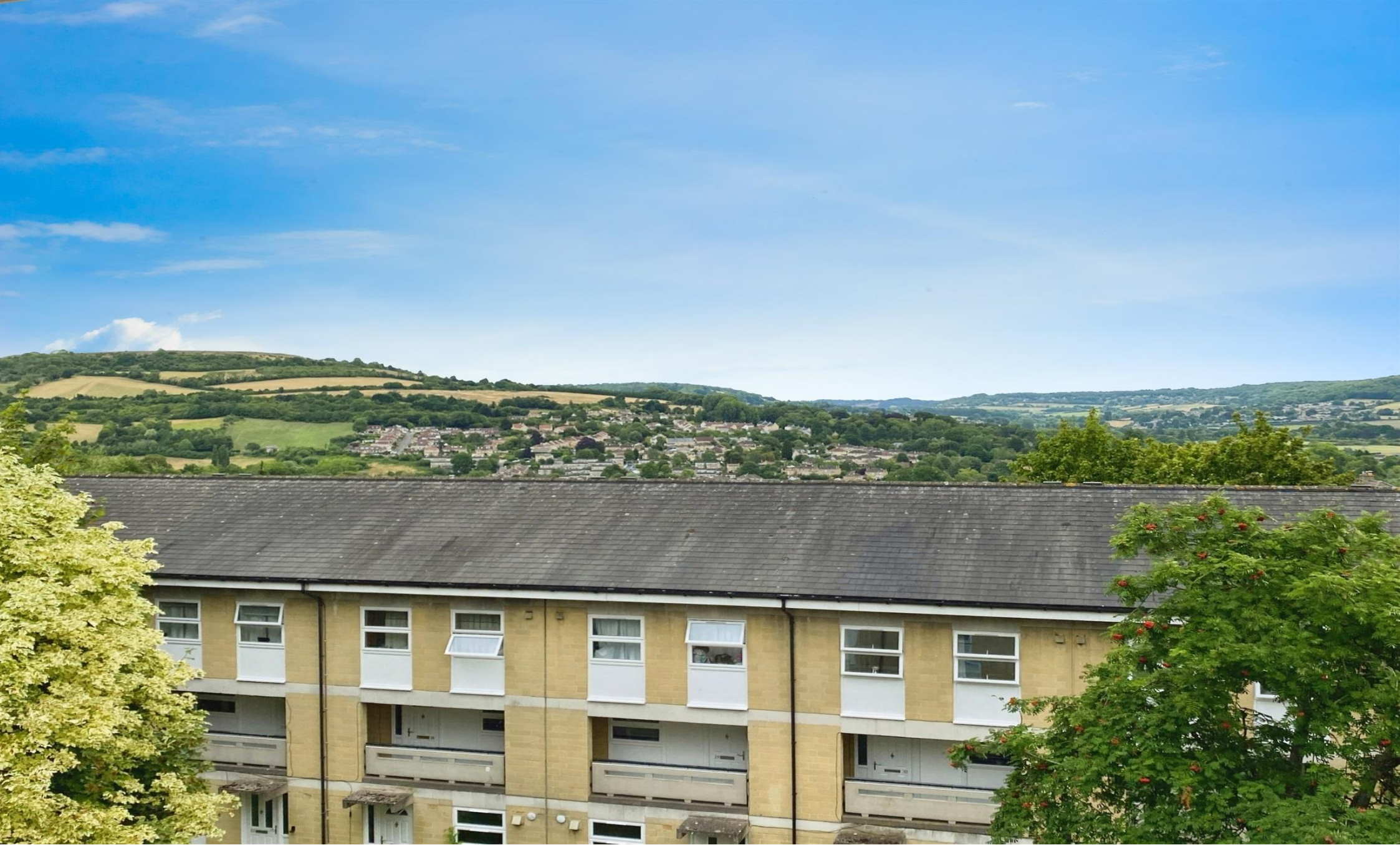
Midsummer Buildings, Bath, BA1 6JH