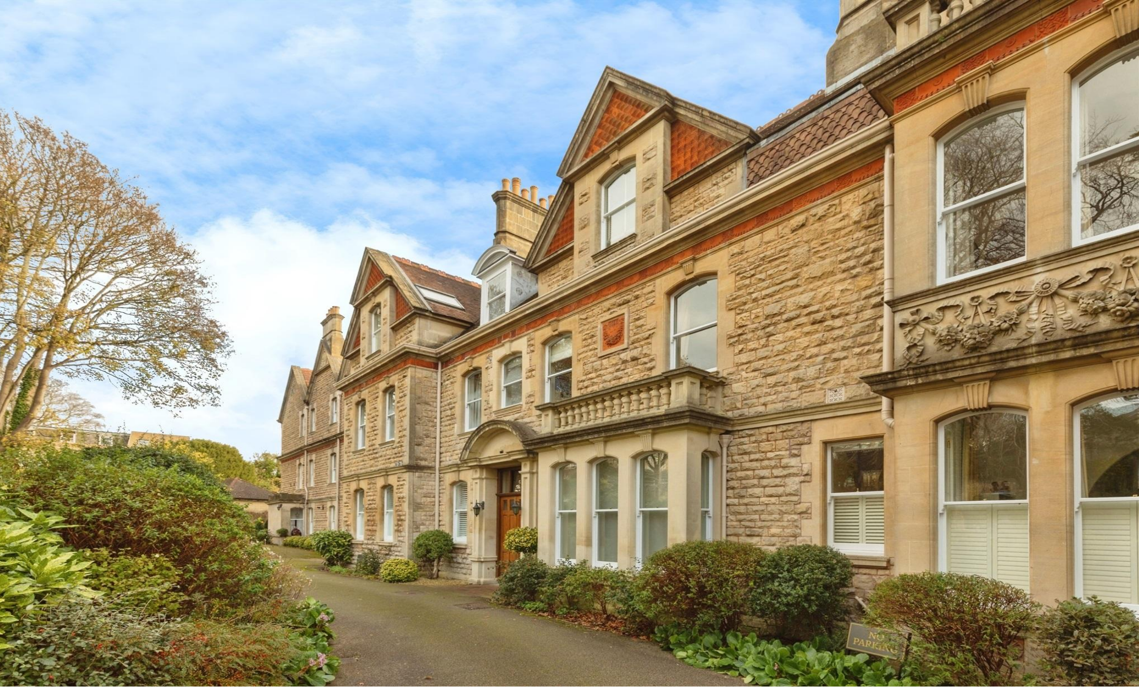
Haygarth Court, Lansdown Grove, Bath, BA1 5EL