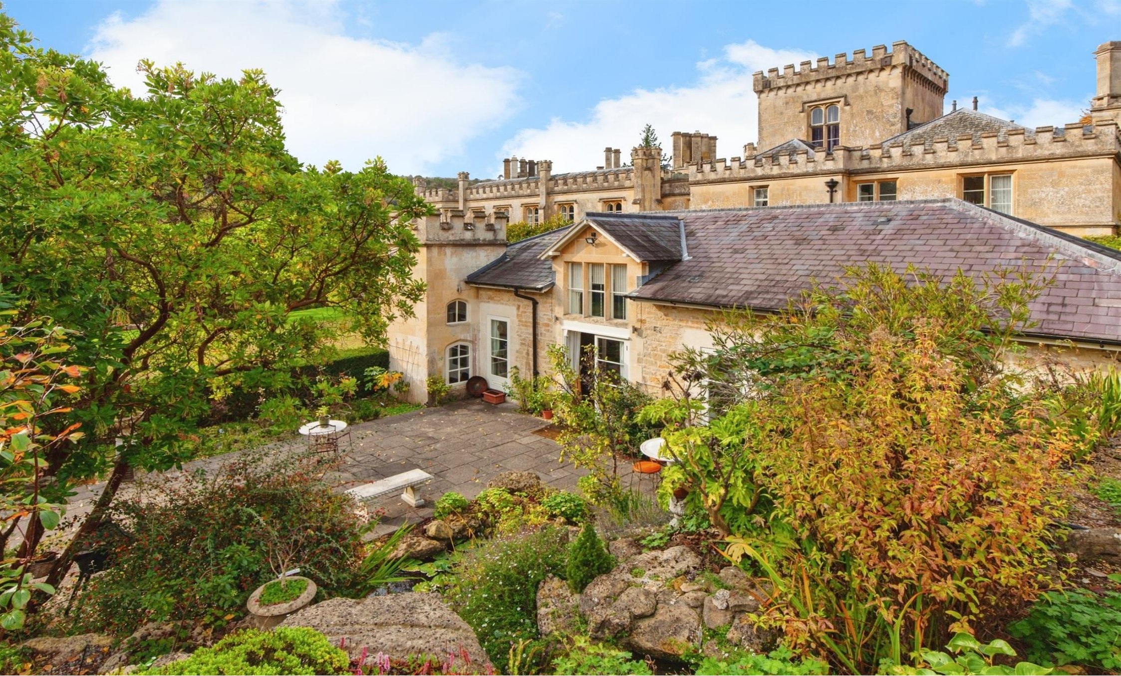
The Bothy, Warleigh Manor, Warleigh, Bath, BA1 8EE