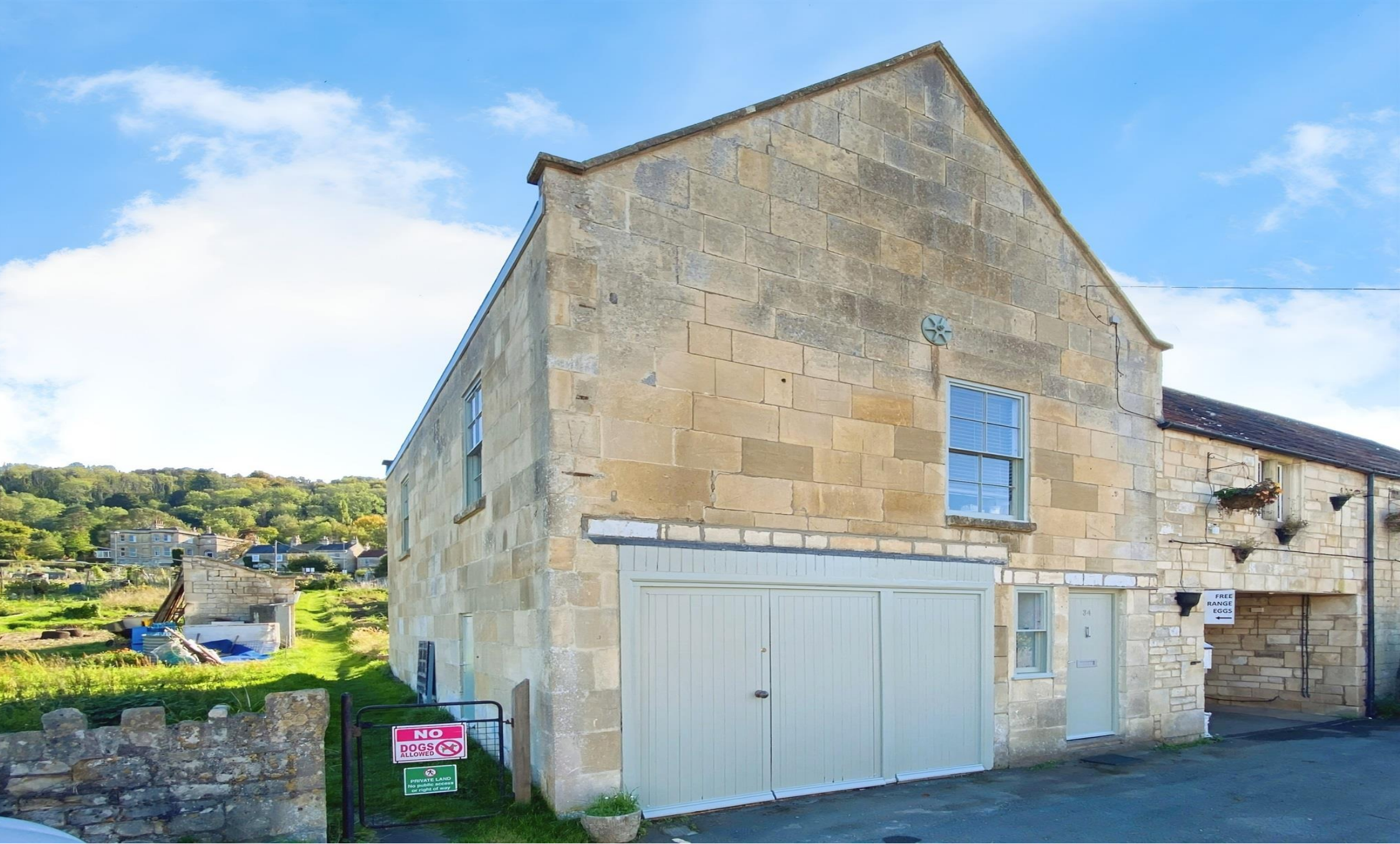
The Old Brewery, Ashley Road, Bathford, Bath, BA1 7TT