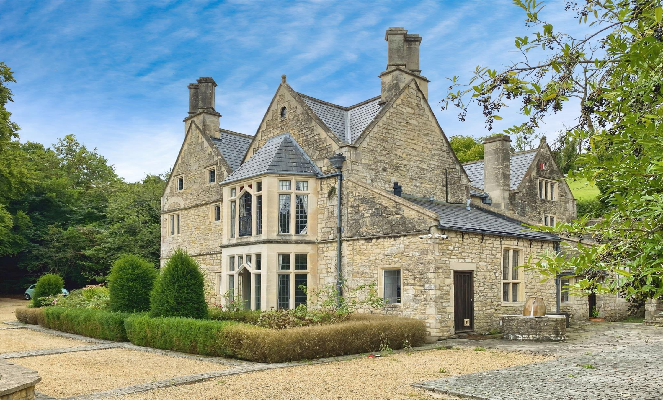
Charlcombe Manor, Charlcombe Lane, Bath, BA1 8DS