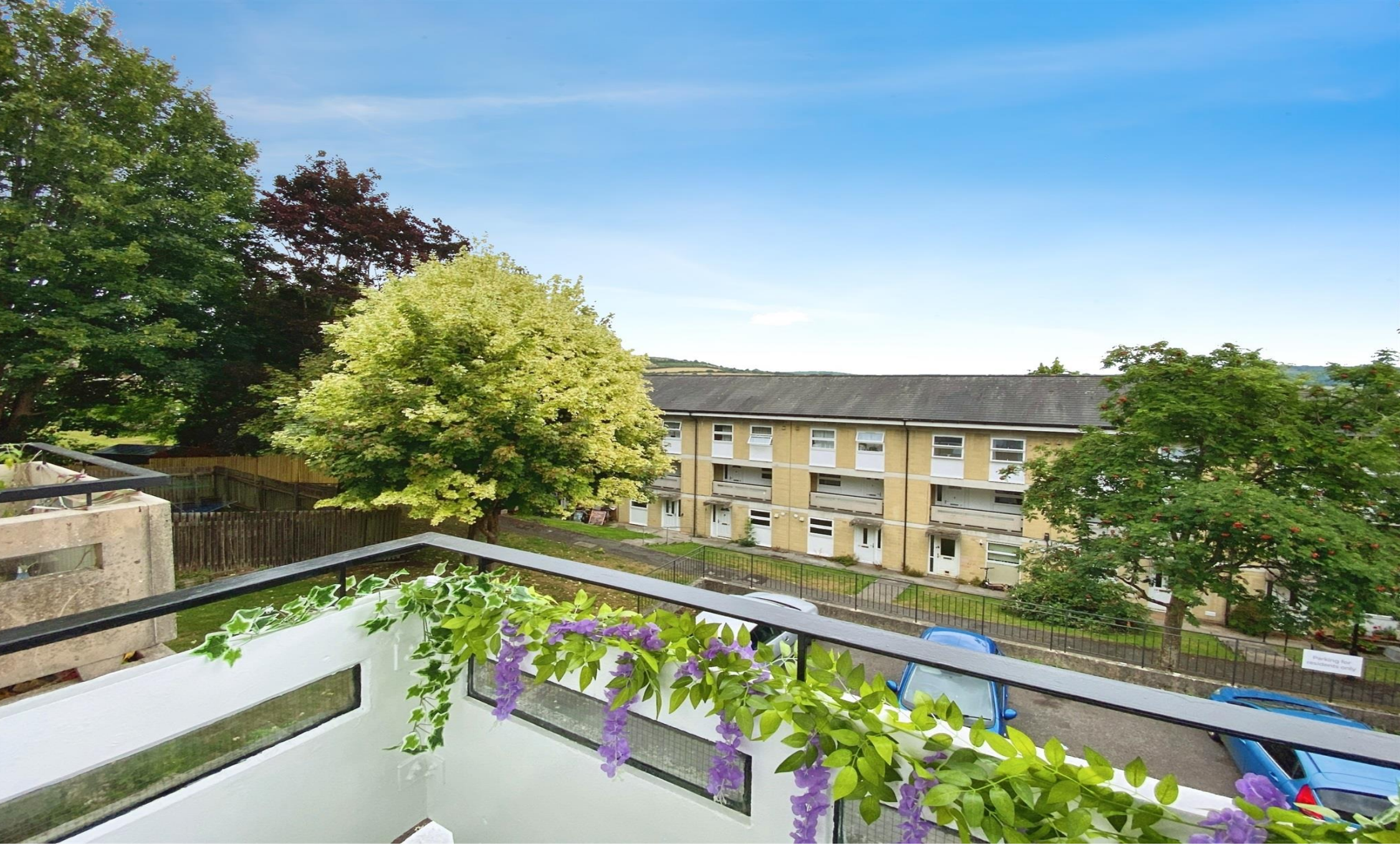
Midsummer Buildings, Bath, BA1 6JH