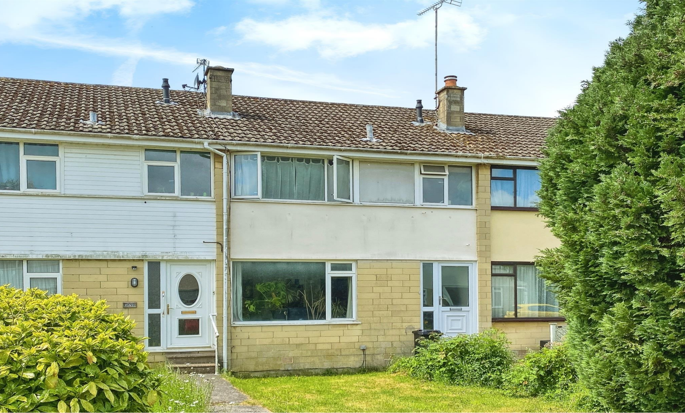
Ringswell Gardens, Bath, BA1 6BP