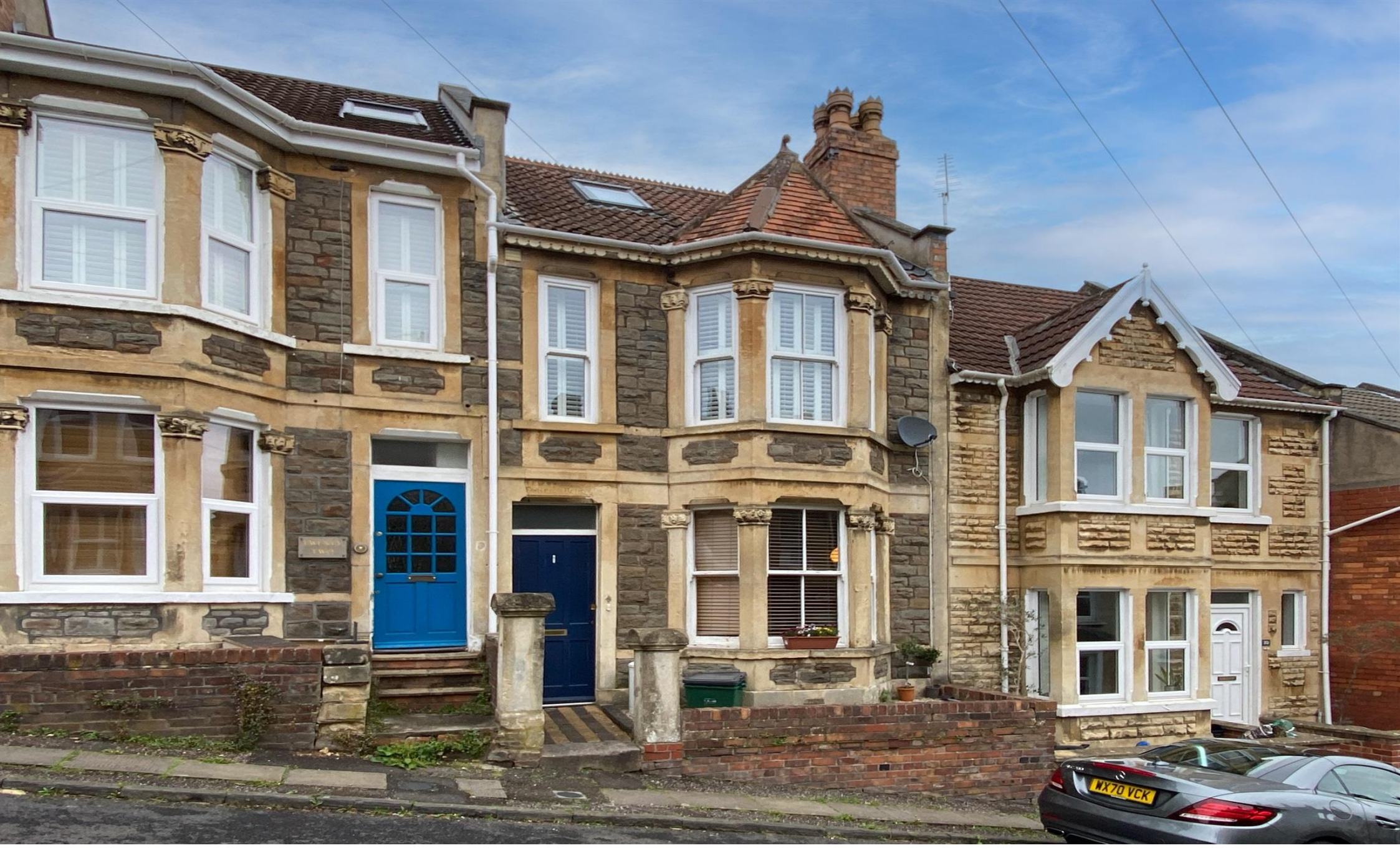
Upper Flat, Queenwood Avenue, BATH, BA1 6EU