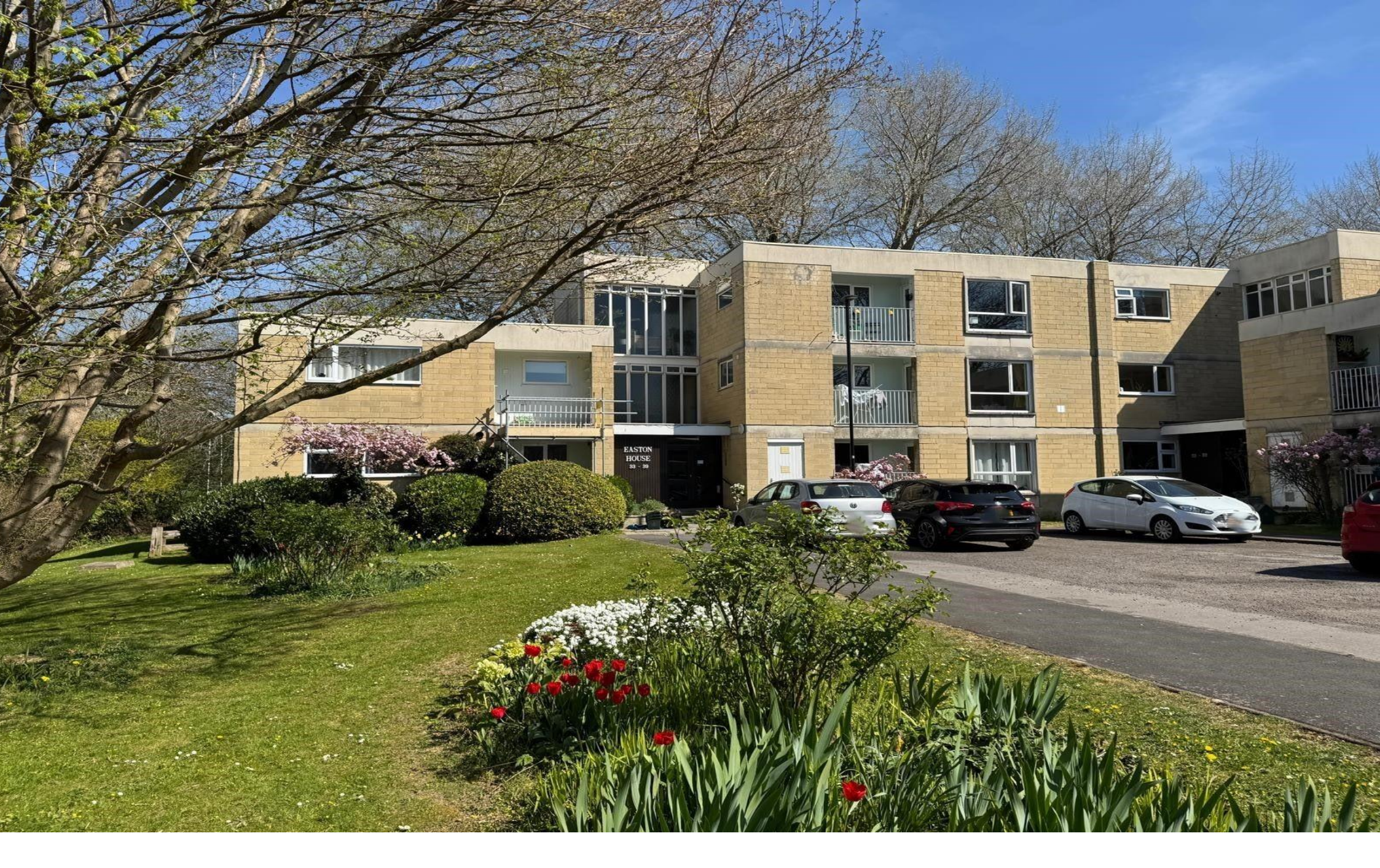
Grosvenor Bridge Road, Bath, BA1 6BG