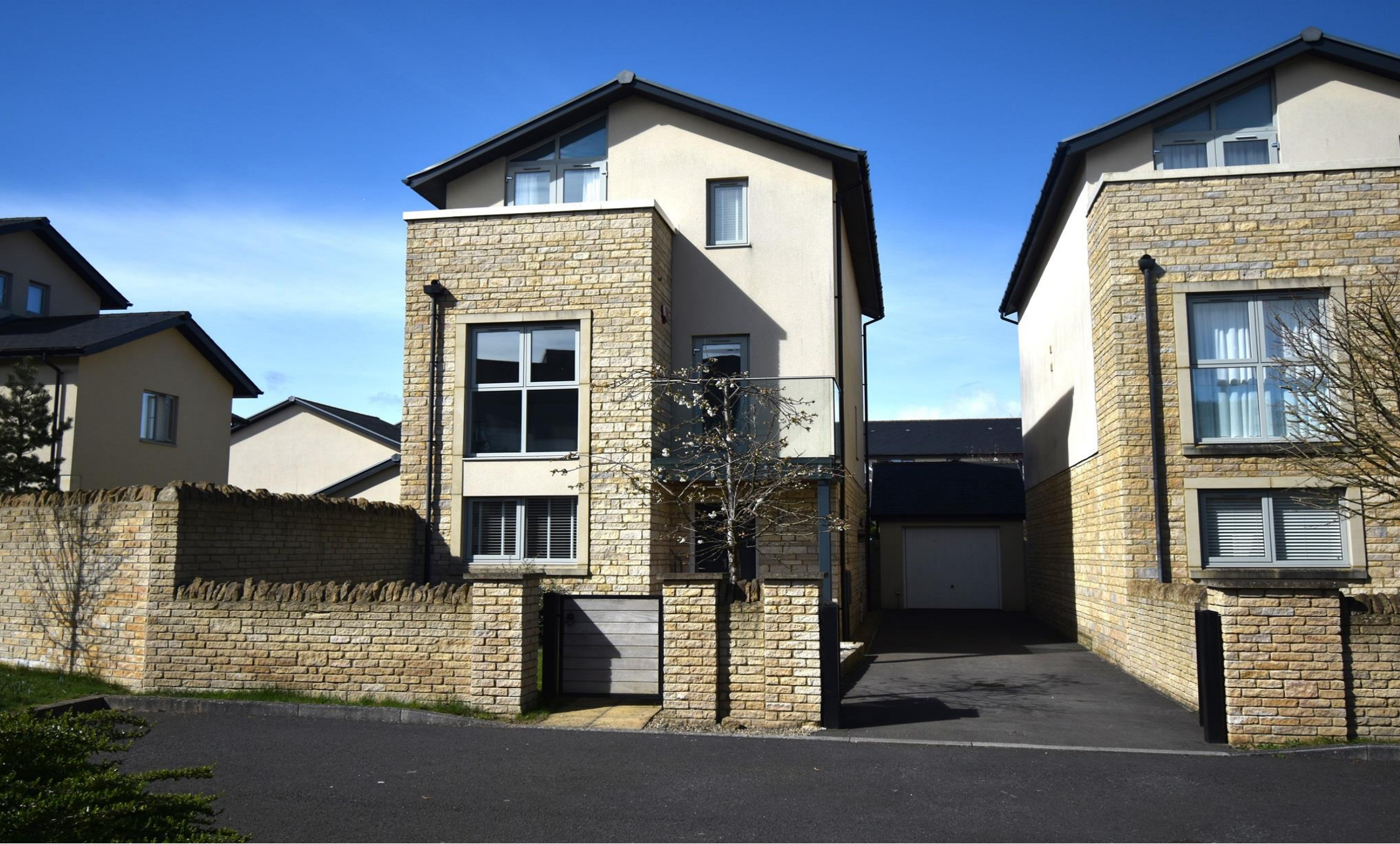
Chelscombe Close, Lansdown, Bath, BA1 9DL