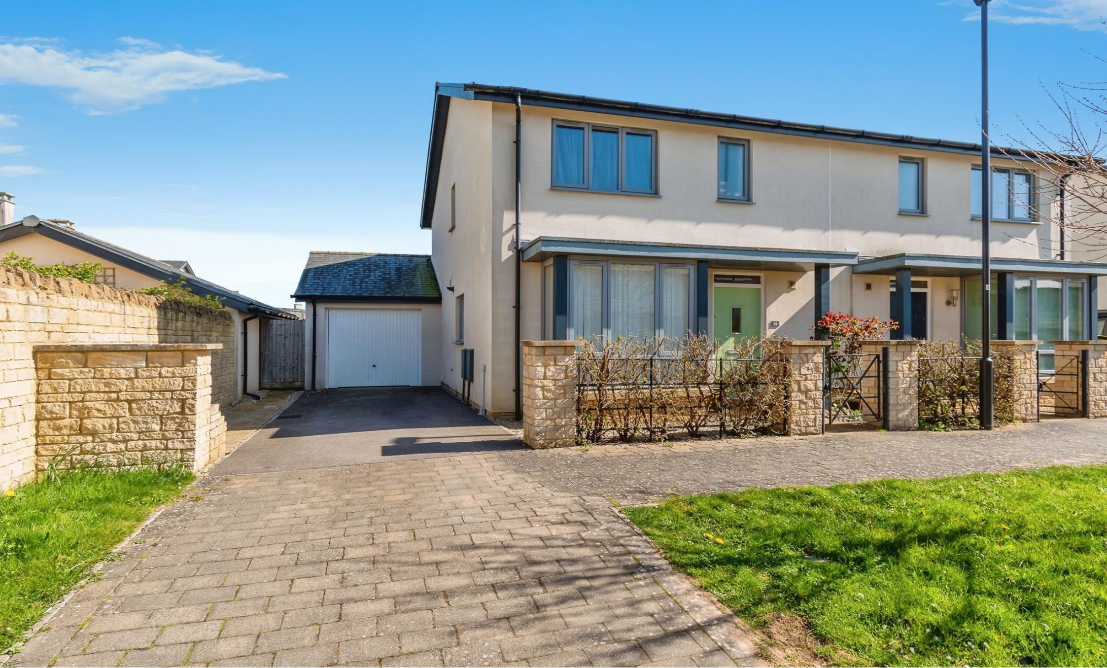
Waller Gardens, Lansdown, Bath, BA1 9DJ