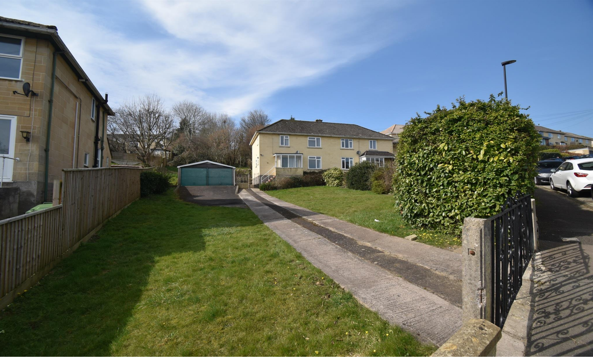
Bay Tree Road, Bath, BA1 6NE