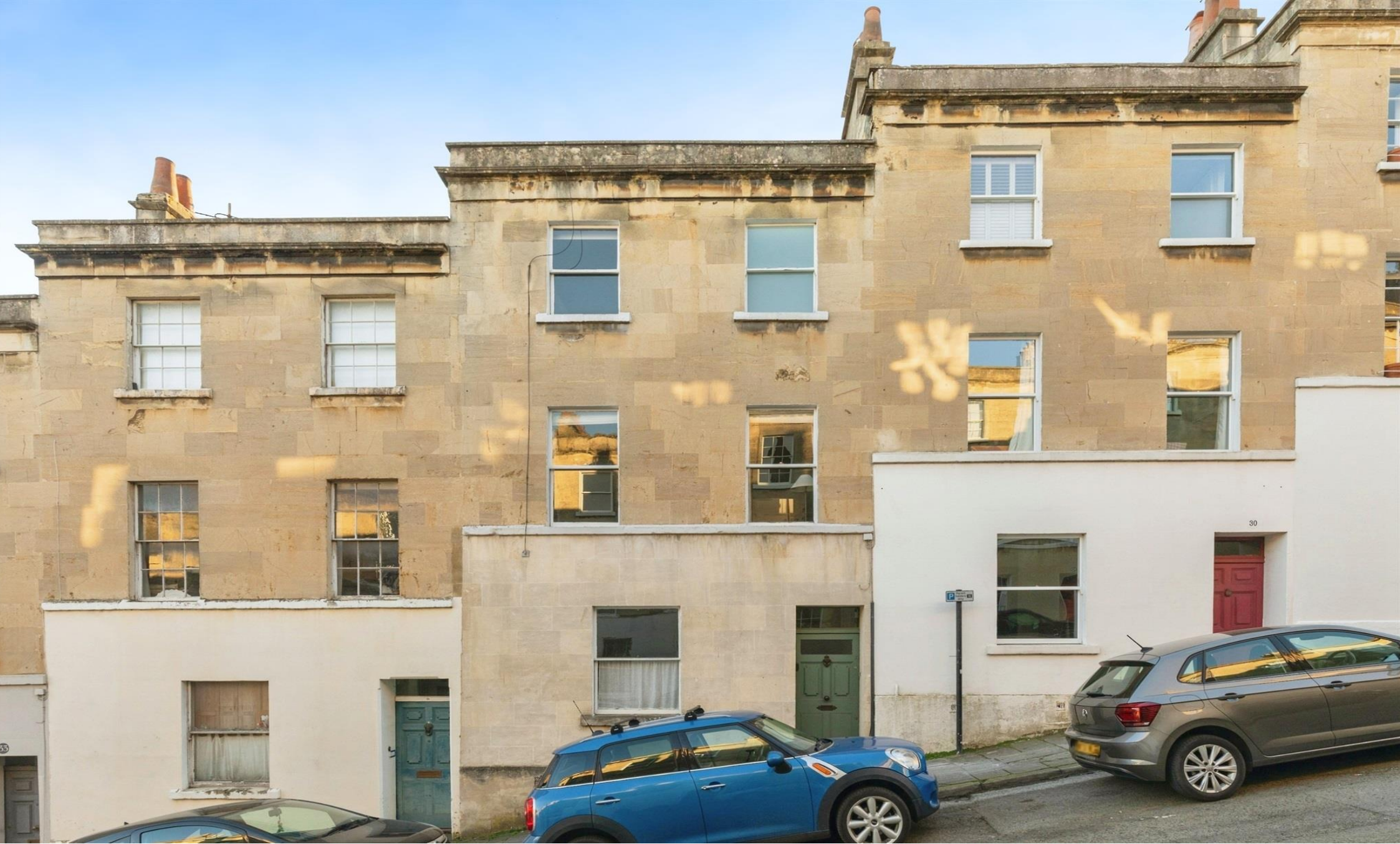
Thomas Street, Bath, BA1 5NN