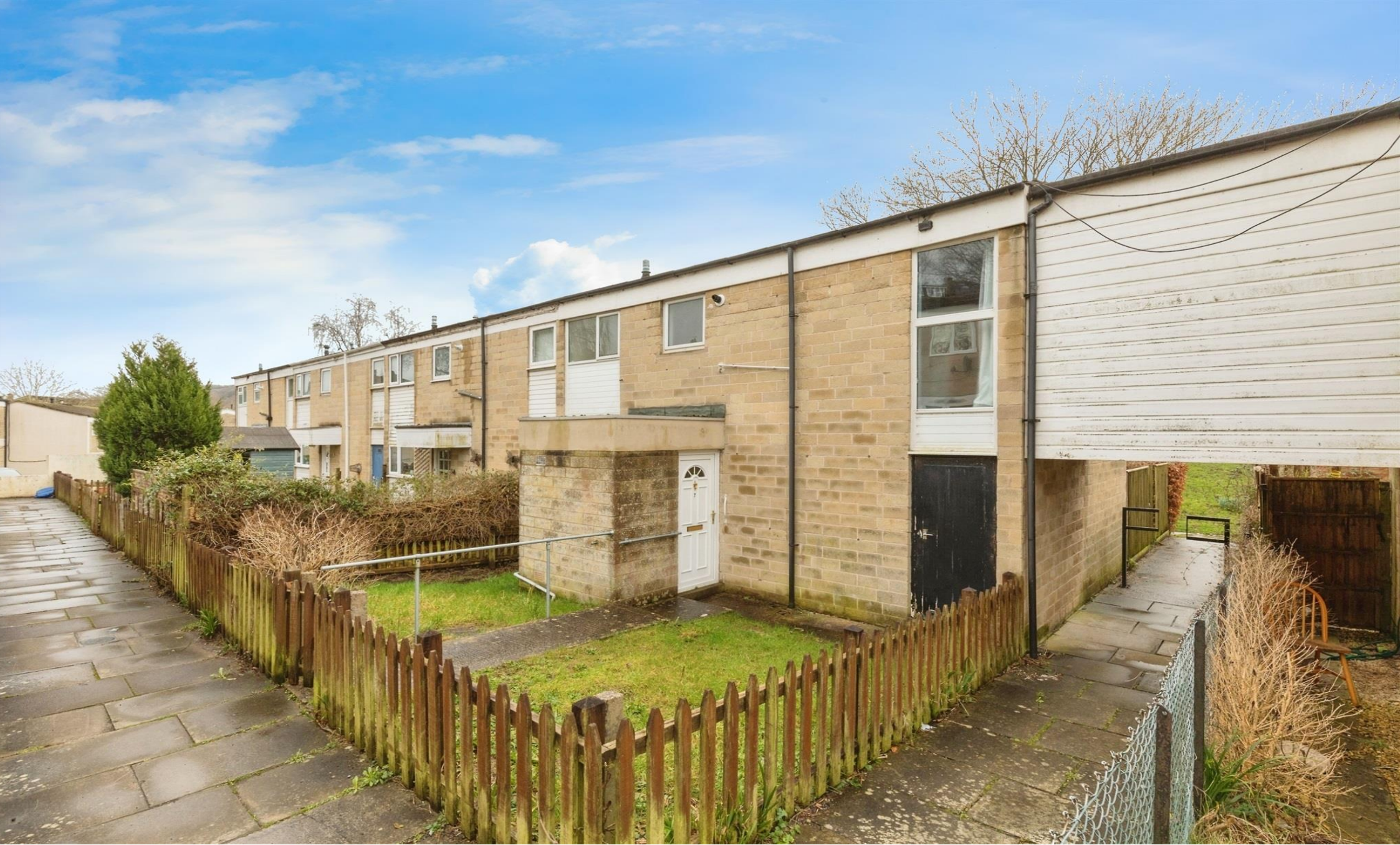
Uphill Drive, Bath, BA1 6PB