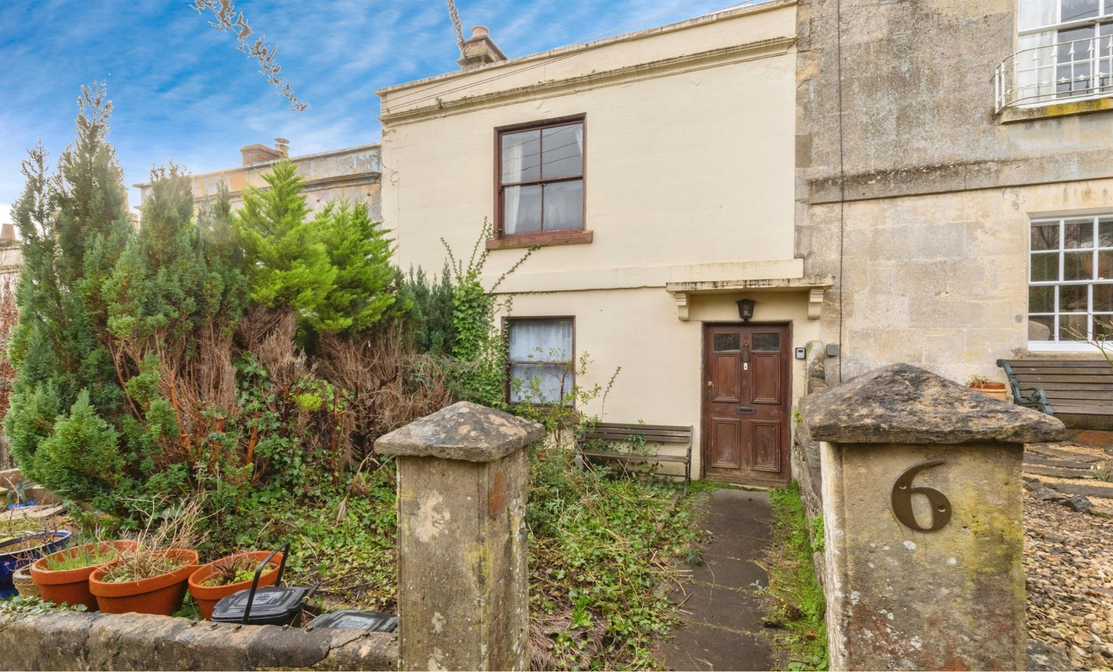
Dover Place, Bath, BA1 6DX