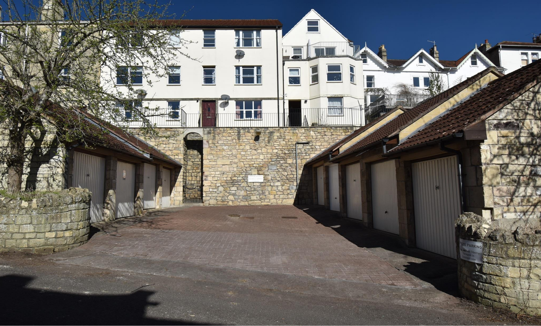
Chilton Road, Bath, BA1 6DR