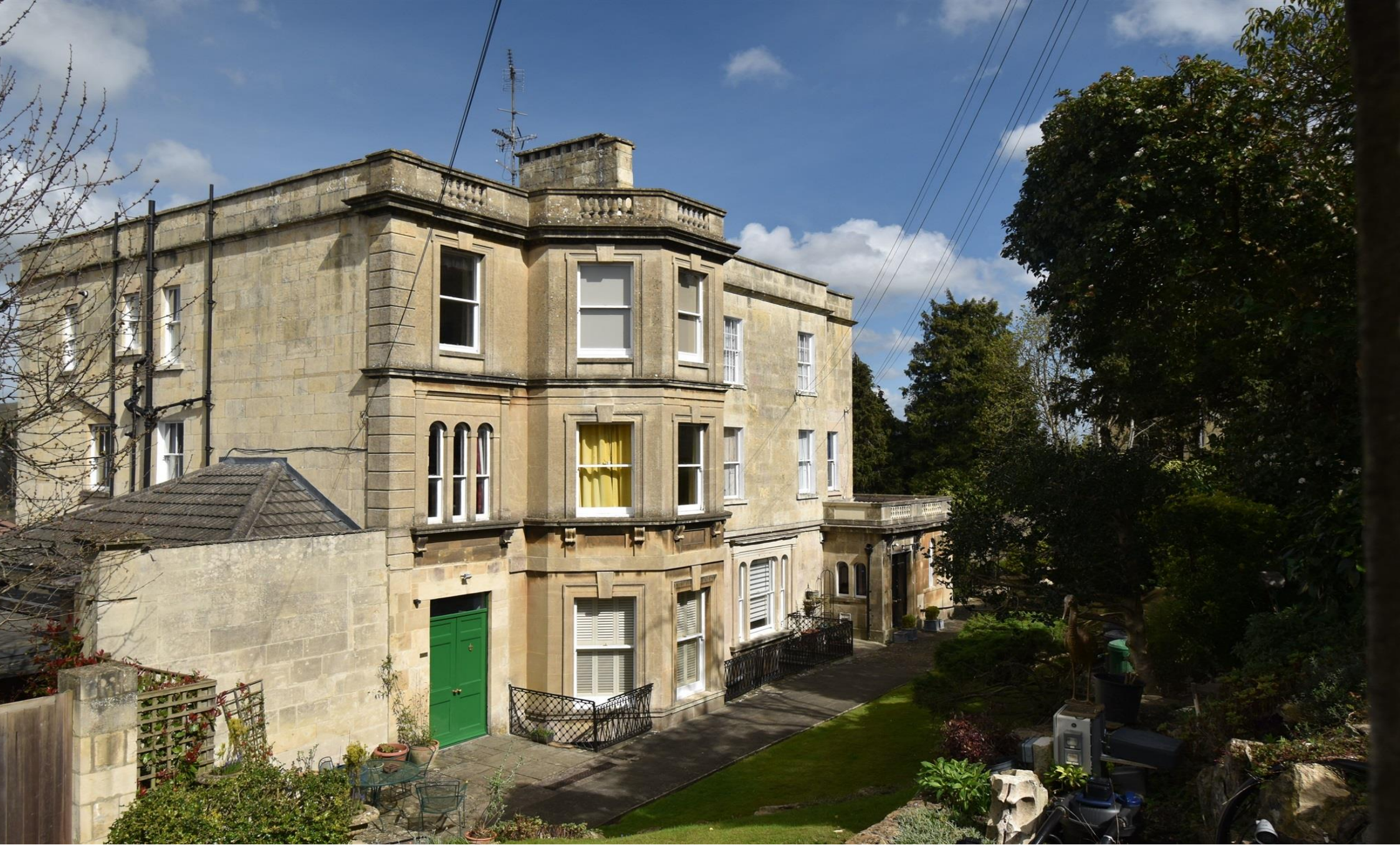
Hampton Hall, Warminster Road, Bath, BA2 6SQ