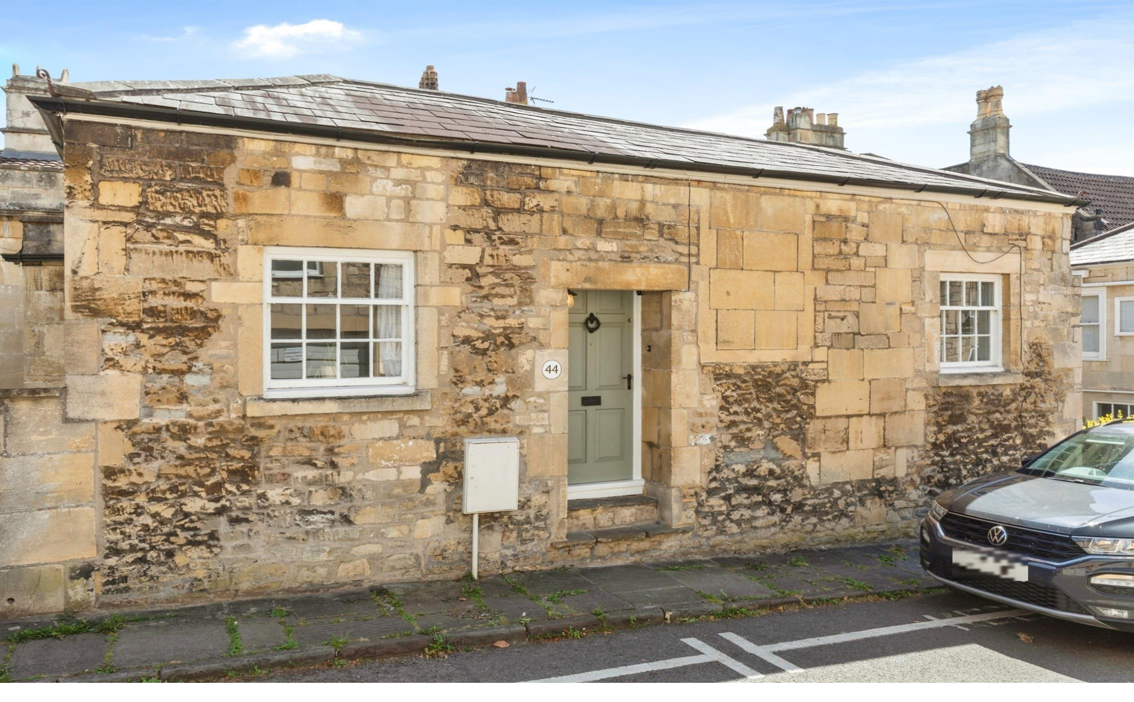
Upper East Hayes, Bath, BA1 6LR