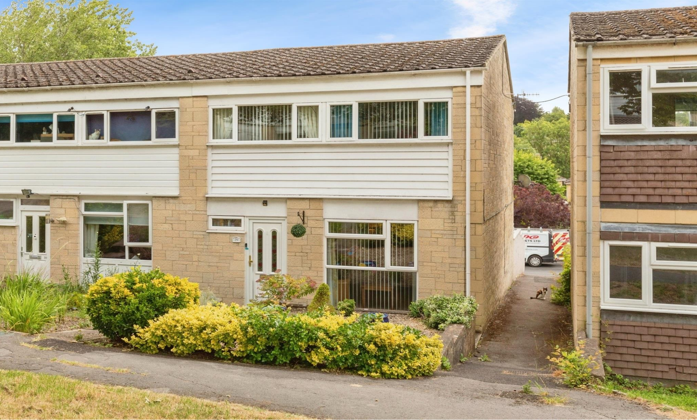
Rose Hill, Bath, BA1 6SZ