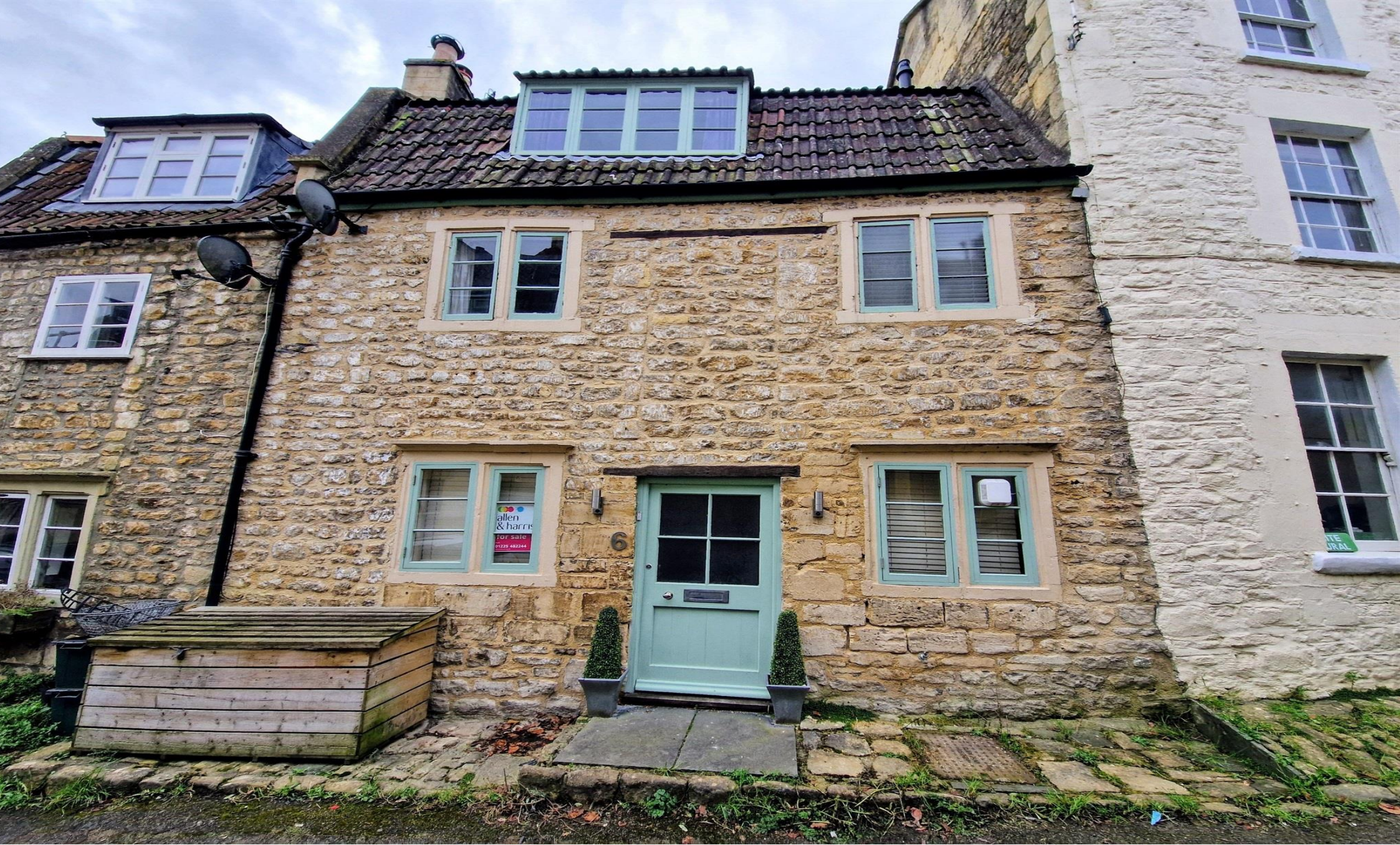
Avonvale Place, Batheaston, Bath, BA1 7RF