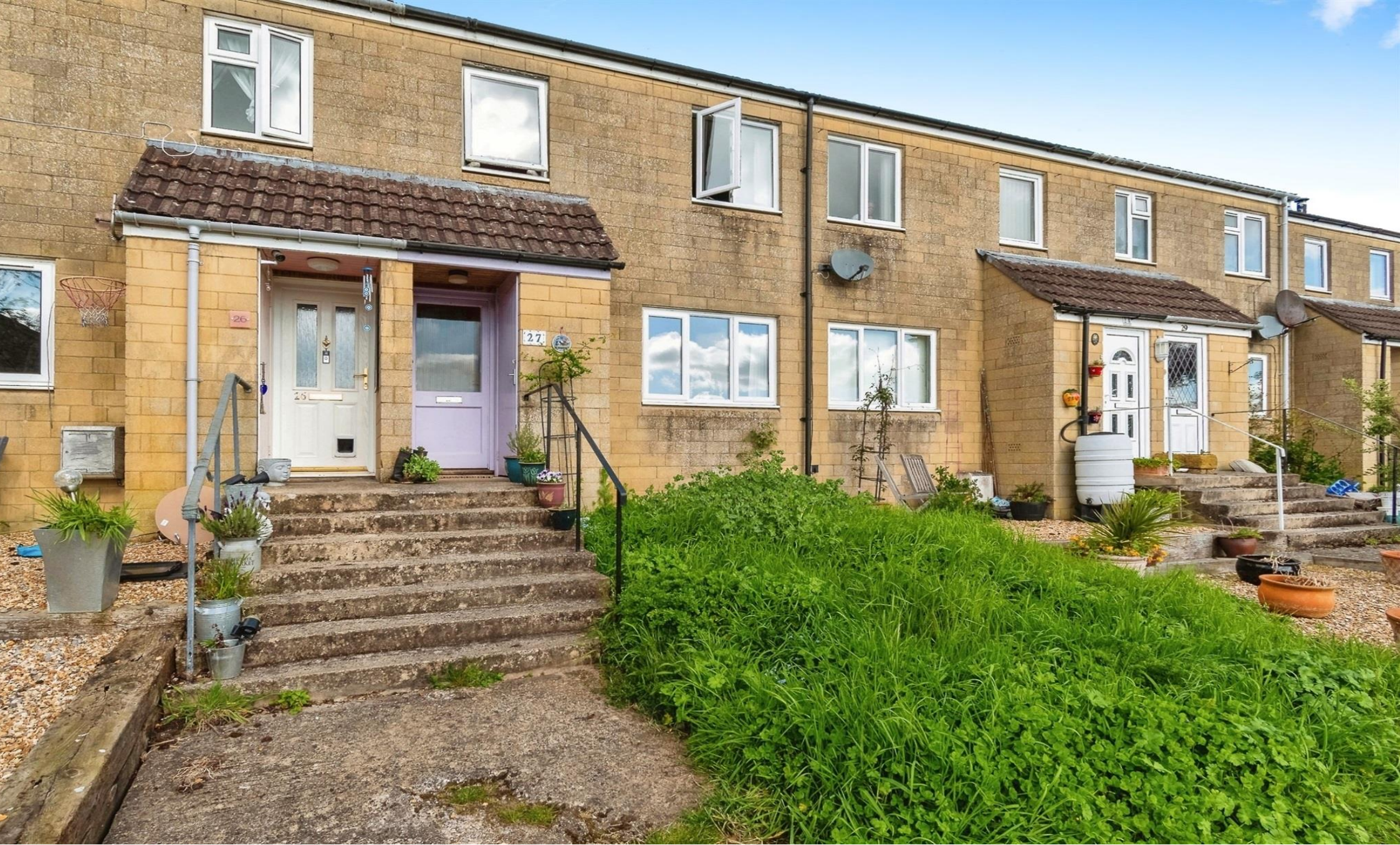
Valley View Close, Bath, BA1 6TP