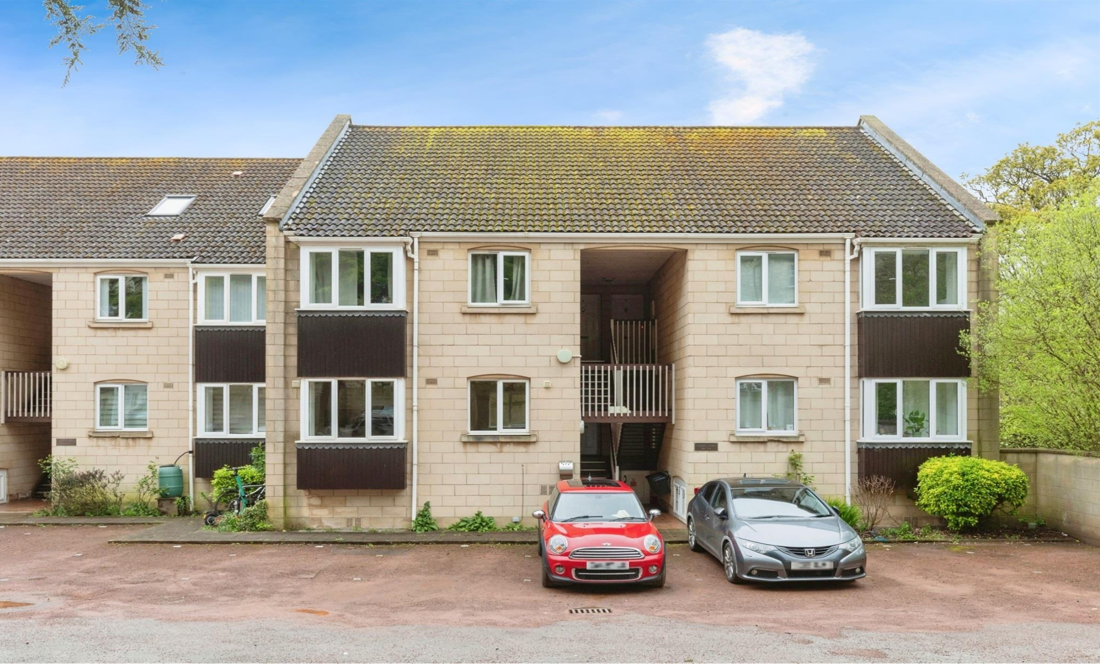
Bedford Court, Bedford Street, Bath, BA1 6PH