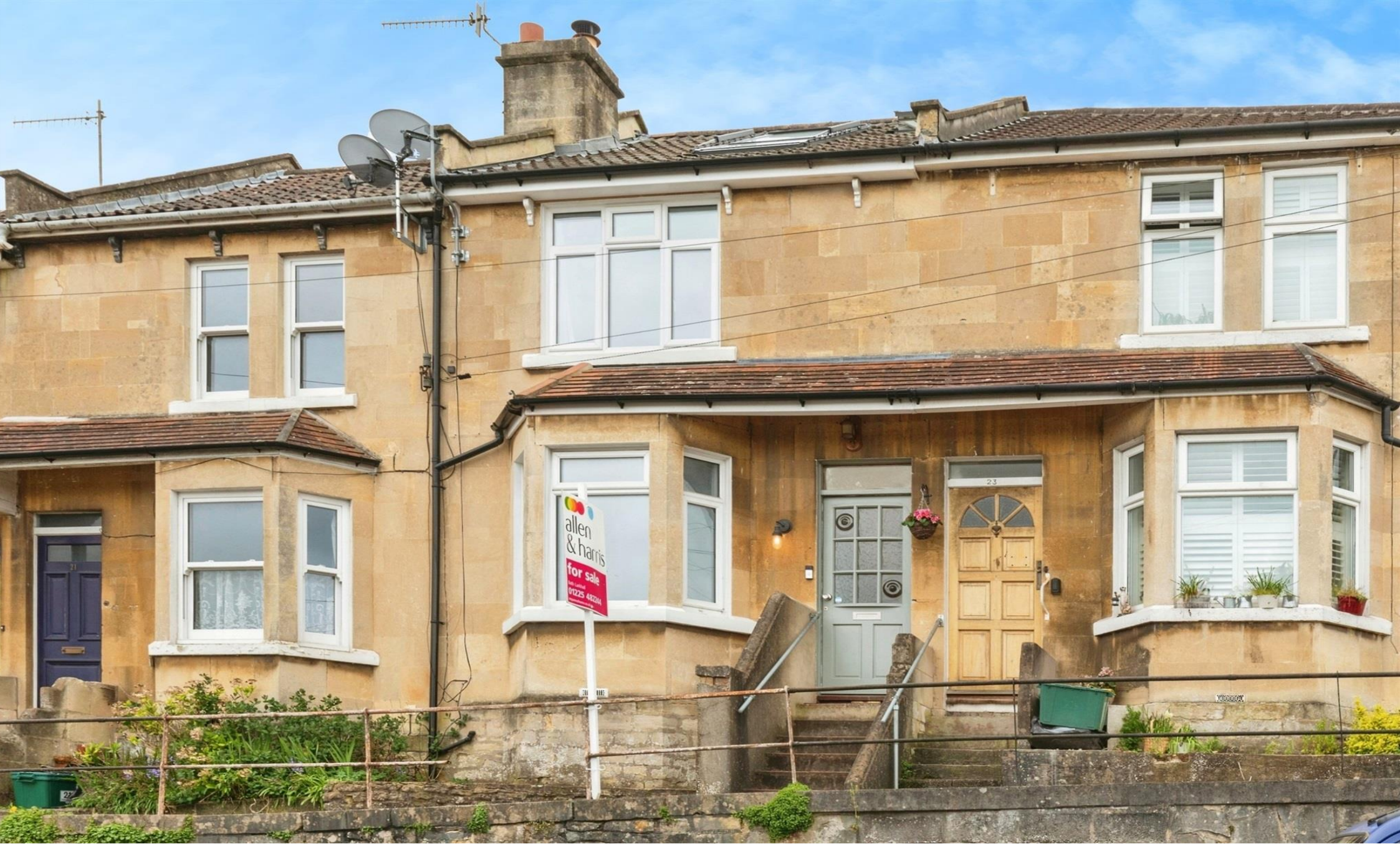
Tyning Terrace, Bath, BA1 6ET