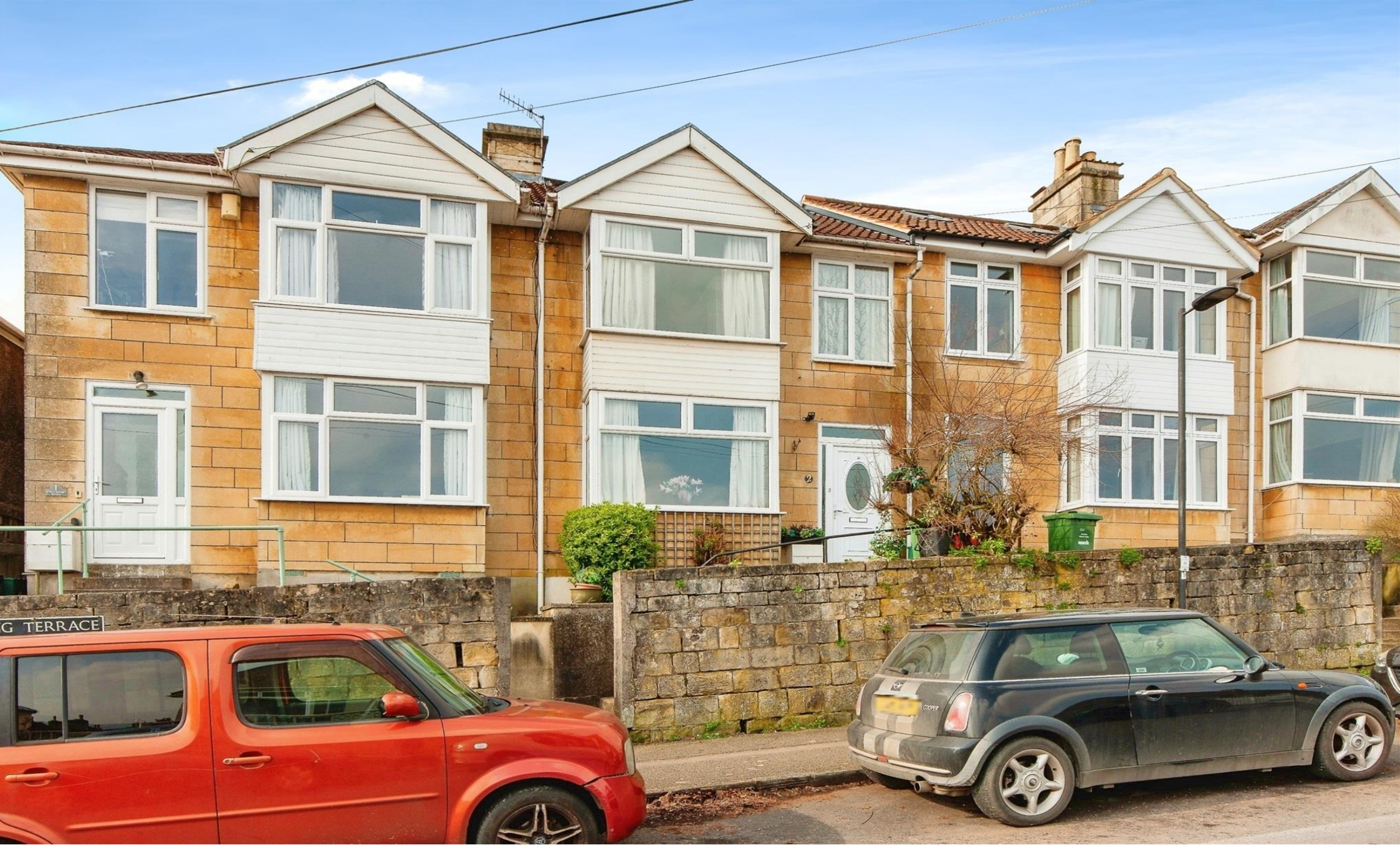
New Tynning Terrace, Fairfield Park, Bath, BA1 6ER