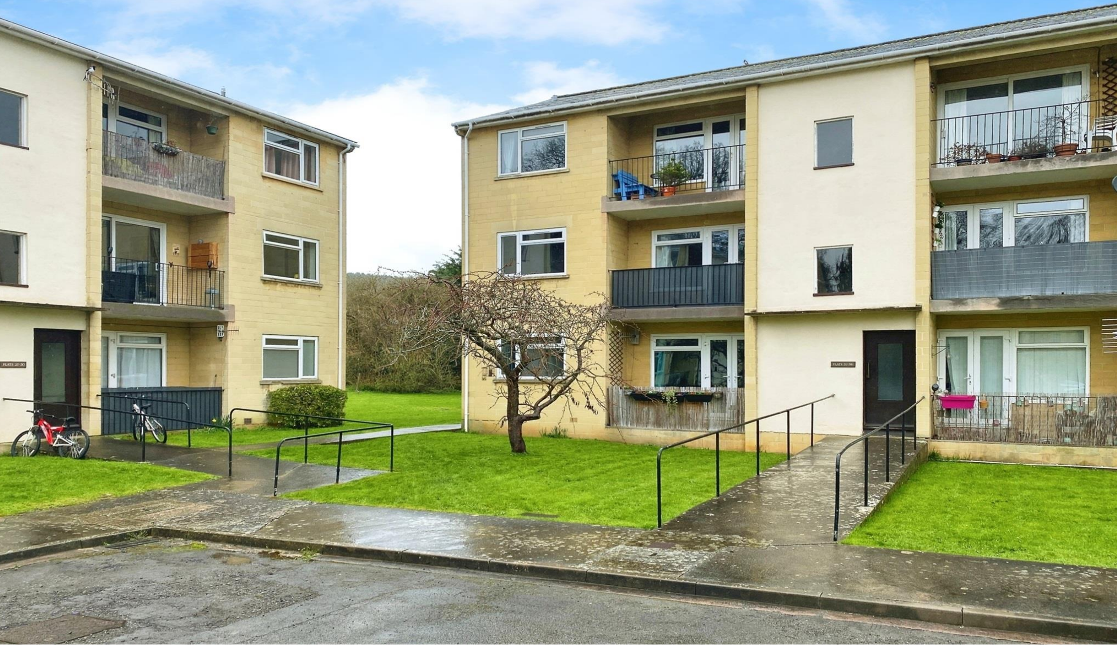
Jesse Hughes Court, BATH, BA1 7BG