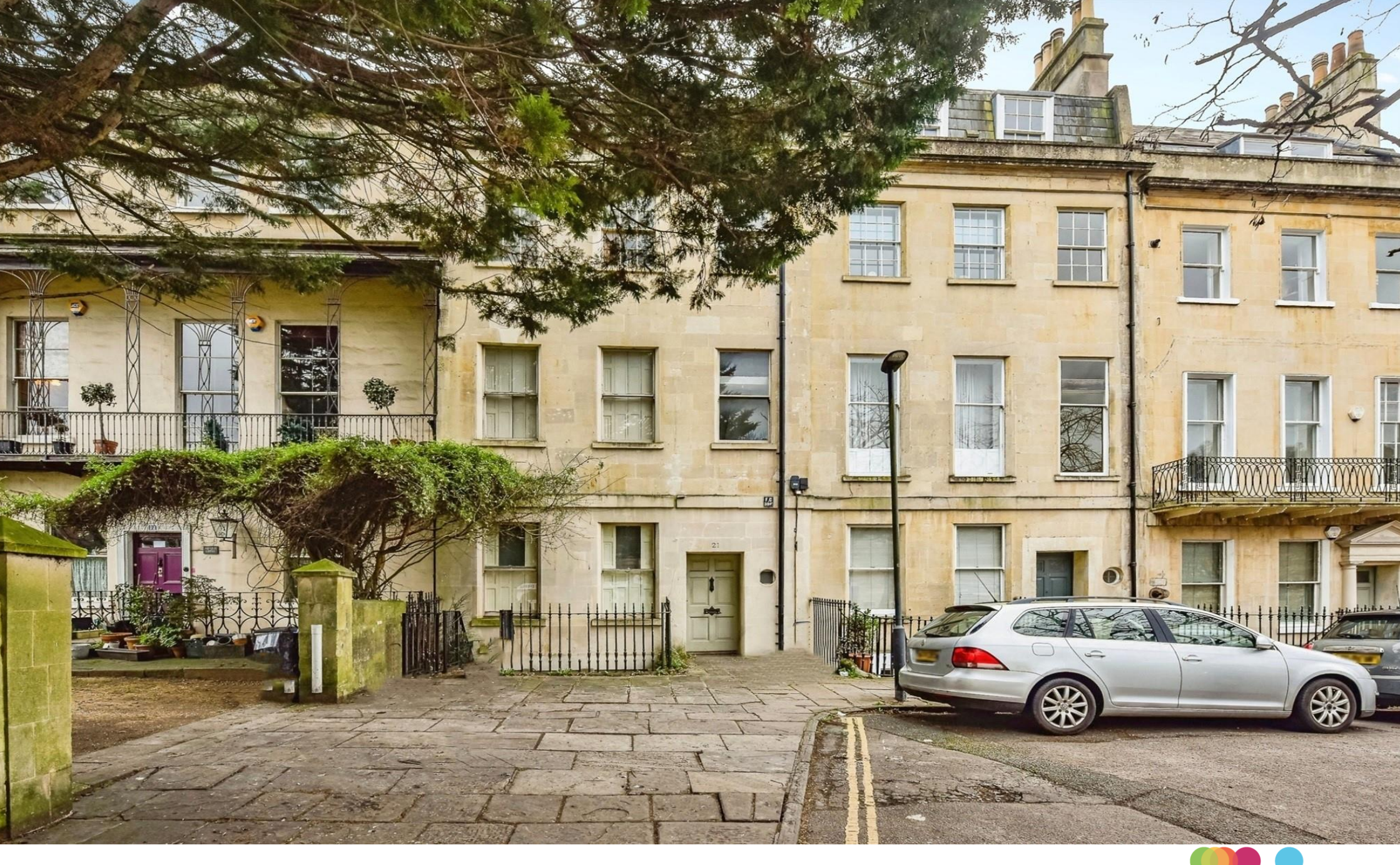
Second Floor Flat, Kensington Place, Bath, BA1 6AP