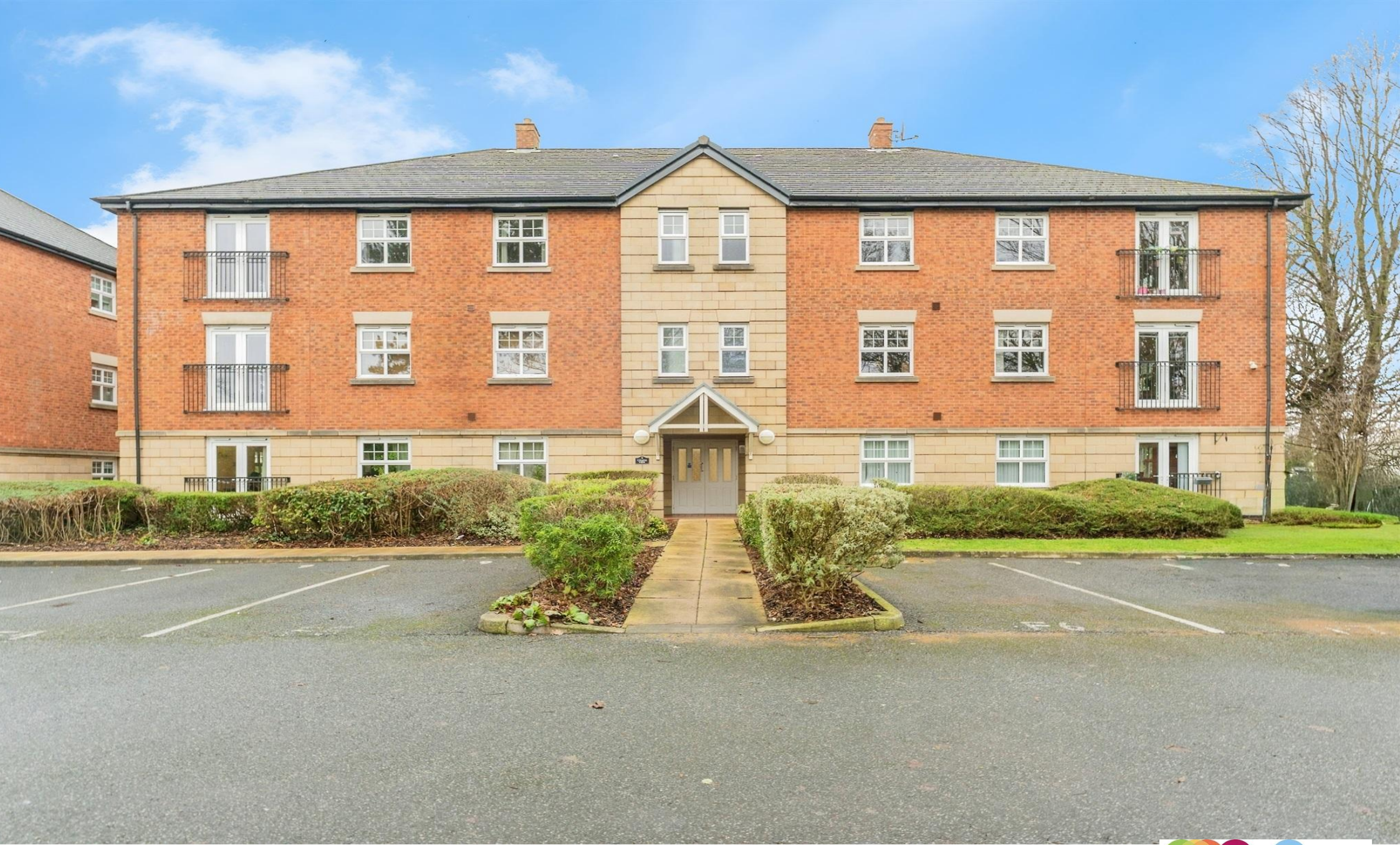
Chapel View, Eastham Wirral CH62 0BF