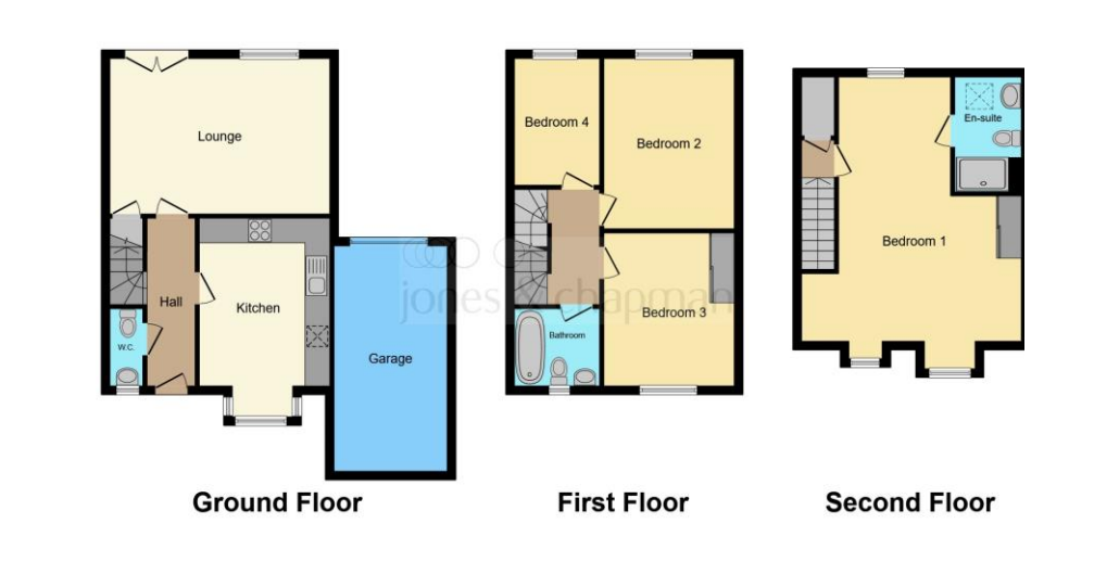
This floor plan is for illustrative purposes only. It is not drawn to scale. Any measurements, floor areas (including any total floor area), openings and orientation are approximate. details are guaranteed, they cannot be relied upon for any purpose and they do not form part of any agreement. No liability is taken for any error, omission or misstatement. A pa must rely upon its own is precision(s). Powered by www.focalagent.com

Tenure: Freehold EPC Rating: C Council Tax Band: D