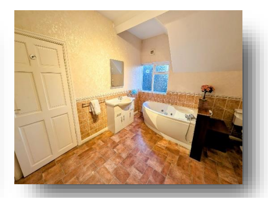
view this property online jonesandchapman.co.uk/Property/BEB110350